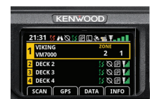
Night - High Contrast